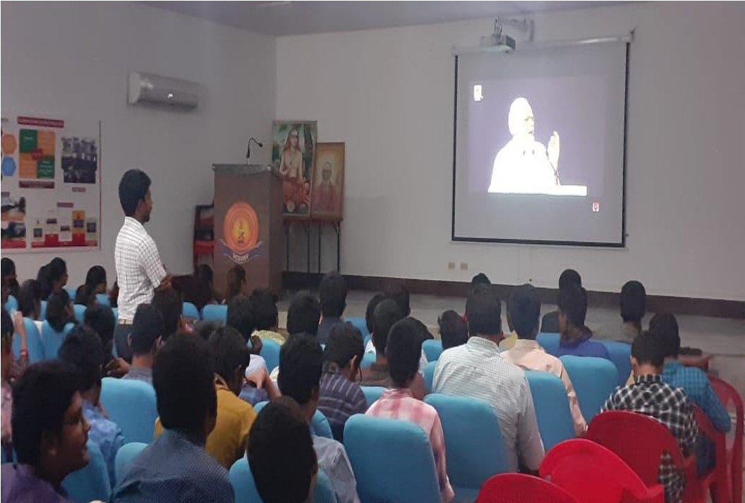
Fit India Movement Pledge Taken by staff and students