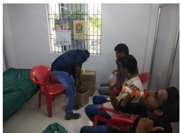
Certificates were given to all the blood donors as a token of appreciation..